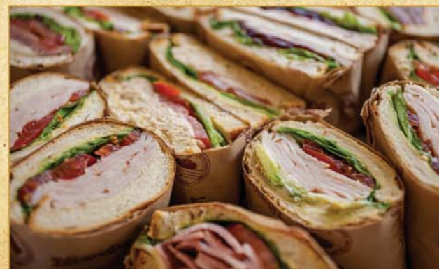
Assorted Sandwich Tray